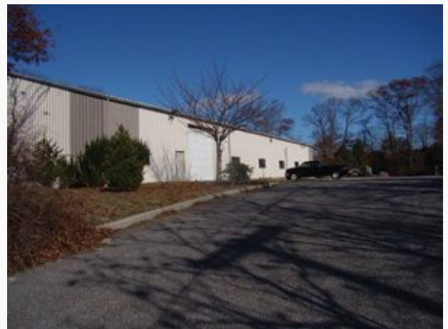
82 Columbus Avenue – Riverhead, NY