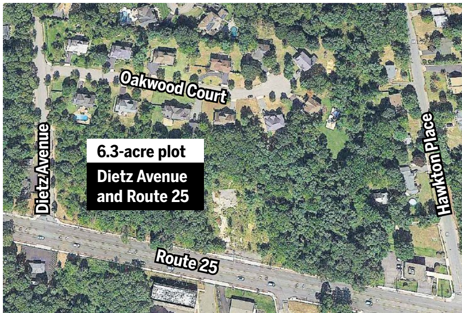
About 6 acres of land at Dietz Avenue and Route 25 has been purchased for $4 million, with Brookhaven's development agency granting tax breaks and expecting 80 jobs to be created.